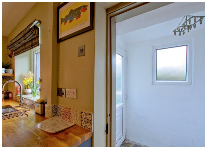
Rear Porch 2'10" x 5'9" (0.86m x 1.75m)

Handy rear porch with UPVC double glazed door and window to the rear aspect. Flagged tile flooring.