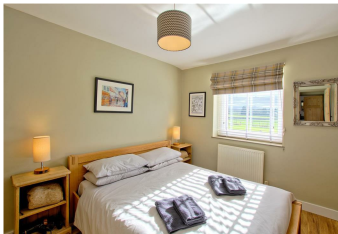
Bedroom 1 12'0" x 8'11" (3.67m x 2.73m)

Good-sized double bedroom with UPVC double glazed window to the rear aspect and countryside views. 2 large storage cupboards, one of which houses the gas central heating boiler. Laminate flooring. Radiator.